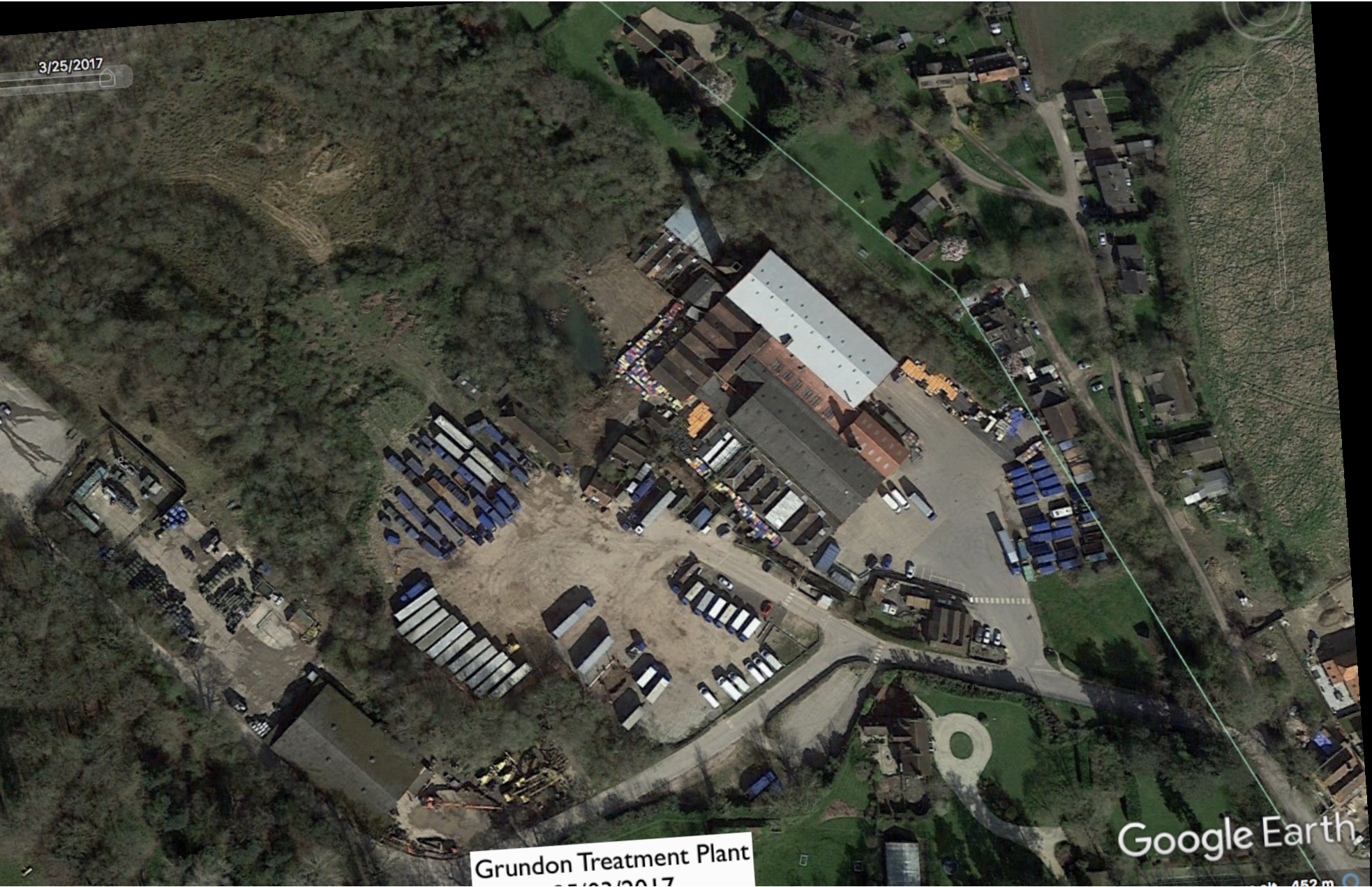
Grundon Treatment Plant 3/25/2017