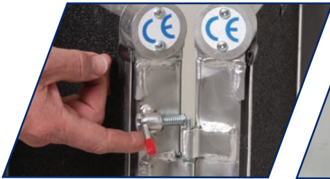
"QuickCam" Separates Ramp With No Extra Tools And No Missing Hardware