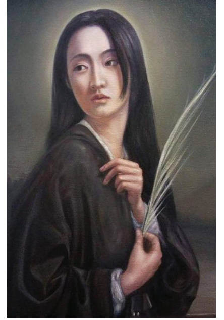
St. Madeline of Nagasaki