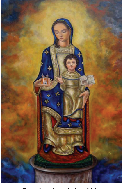
Our Lady of the Way