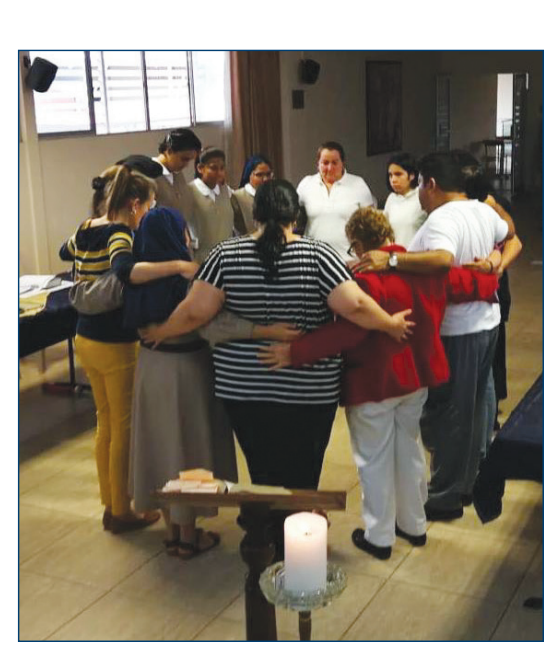
Costa Rica CEAR