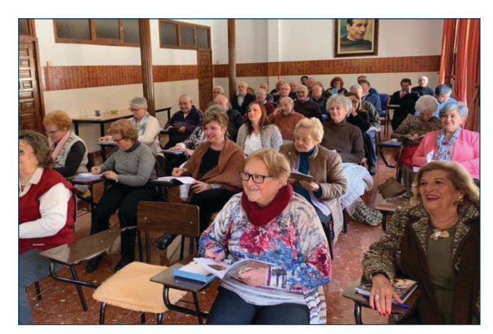
Costa Rica CEAR

Forming people in Augustinian philosophy which has the Gospel at its heart and to lead people to become agents of change in the world.