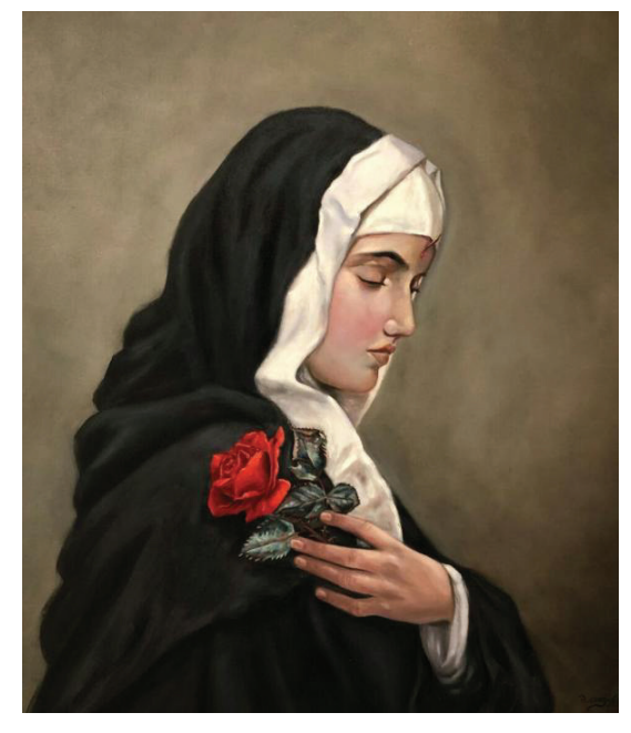
St. Rita of Cascia

A letter to our Friends Lady of Consolation, 2019