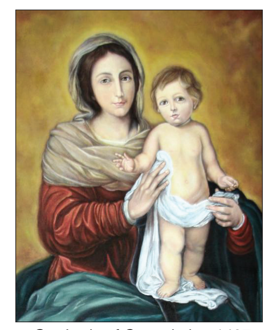
Our Lady of Consolation 1497

I reflected long and hard on how this could happen. As I sat there I began to realise that mental pain is less dramatic than physical pain, but it is much more common and also harder to bear. More than one in ten people suffer depression at some stage in their