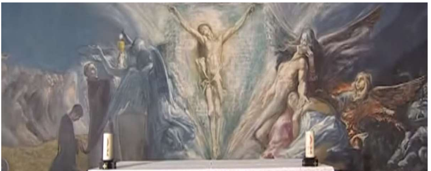
Saint Nicholas offering the Mass for the liberation of the Holy Souls from Purgatory Crypt of Saint Nicholas of Tolentine in St. Rita's Church (Madrid – Spain)