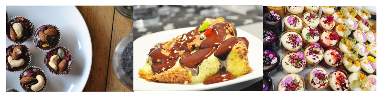
MCHEF® offers you the following possibilities: