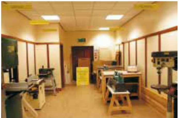
The Workshop takes shape