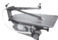
Multicut 1 Variable Speed Code No. HM-1V