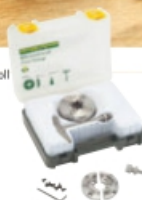
SC4 Professional Geared Scroll Chuck Package