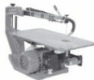
Multicut 2S VariableSpeed Code No. HM-2SV