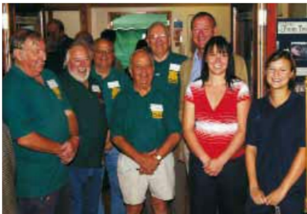
The Club committee with the head ranger and staff

essential attraction in Coombe Country Park, and at the time of writing (November 2011) we have over 130 members. In the four years that we have been operating in our workshop we have given lessons to an average of six persons per week, the majority of these have become members, and at the end of each year we probably lose twelve to fifteen of these, but regain the number and more within six months. Over the past four years the club has raised an average of £2000