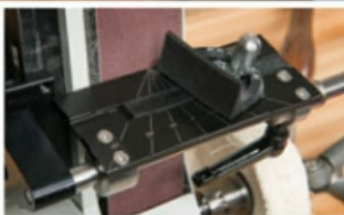
Sharpening Table £24.96 105426