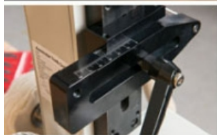
Compound Jig £49.96 103738