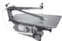
Multicut 1 Code No. HM-1