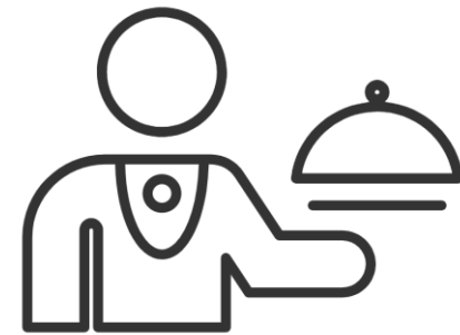
Waiter/ Waitress Kitchen roles