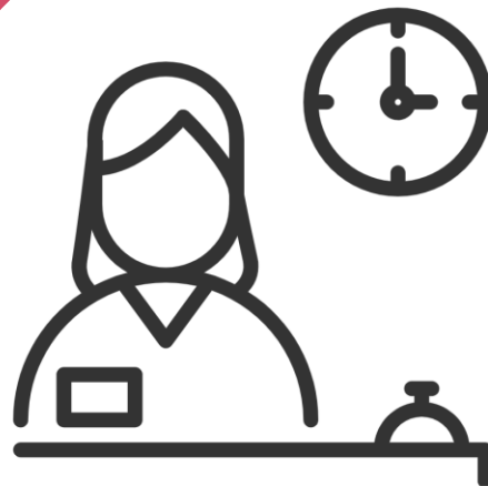
Hotel Receptionist Animator