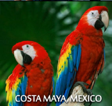
COSTA MAYA, MEXICO