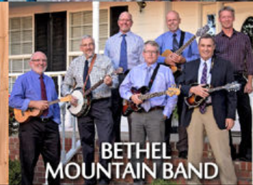
BETHEL MOUNTAIN BAND