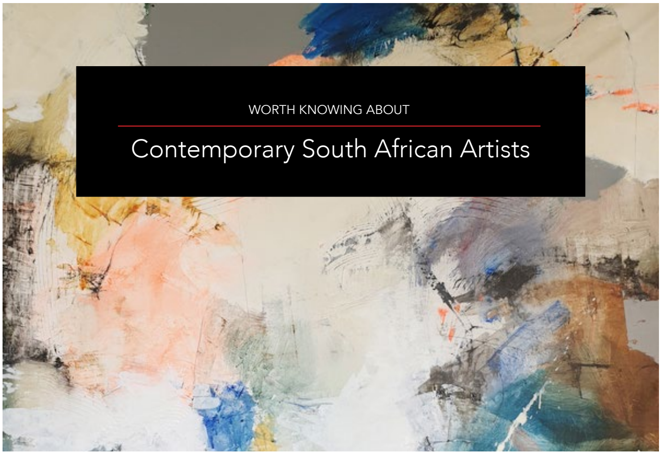
WORTH KNOWING ABOUT (WKA) IS A TRICYCLE PROJECT THAT AIMS TO PROMOTE SOUTH AFRICAN CREATIVES IN NEW AND INNOVATIVE WAYS.