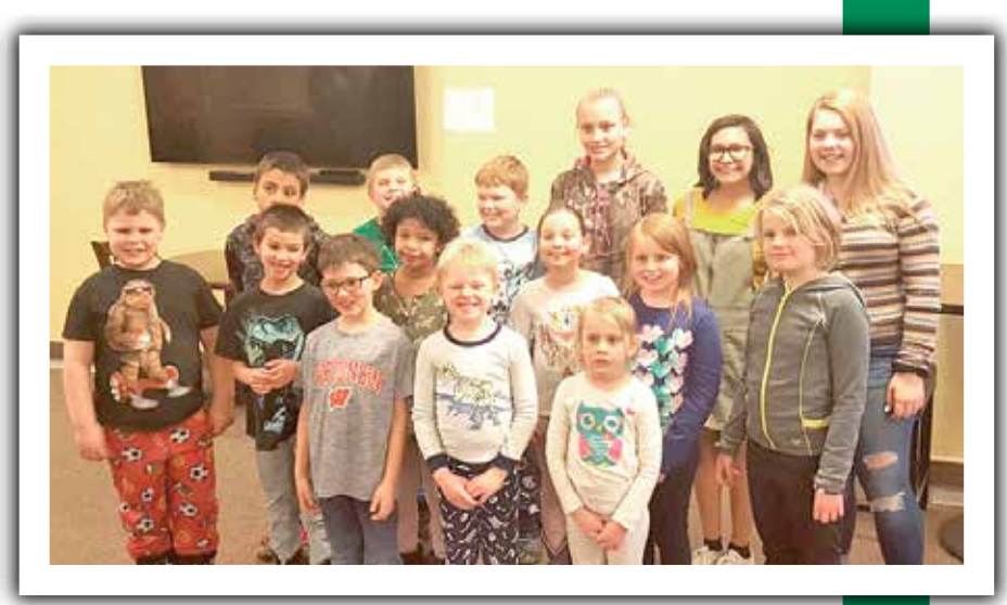
Wood River Beavers Jolly H's