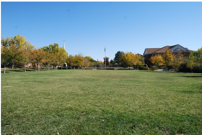
Town Square 50 South Main Circa 1861

Town Square, located inside the downtown historic district, was the site of the Old Bowery, where the early settlers held church and conferences until the completion of the Tabernacle in the 1880s. The scene of patriotic Fourth of July celebrations, today the square is surrounded by some of the city's most prominent historic buildings. The park features several dramatic water features, shade pavilions, a carousel, artwork, and a monument tower.