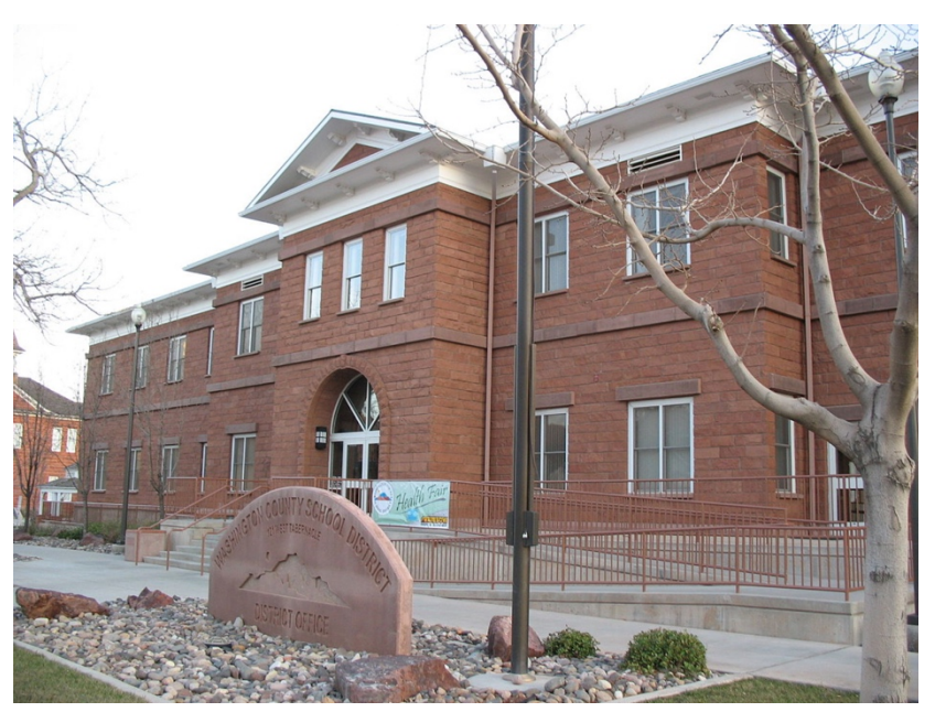
Washington County School District Office