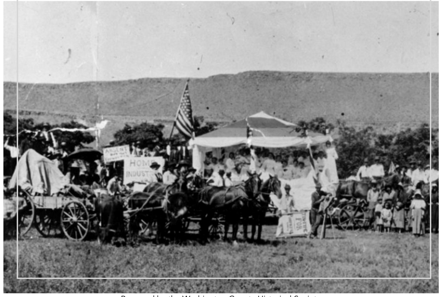
Prepared by the Washington County Historical Society