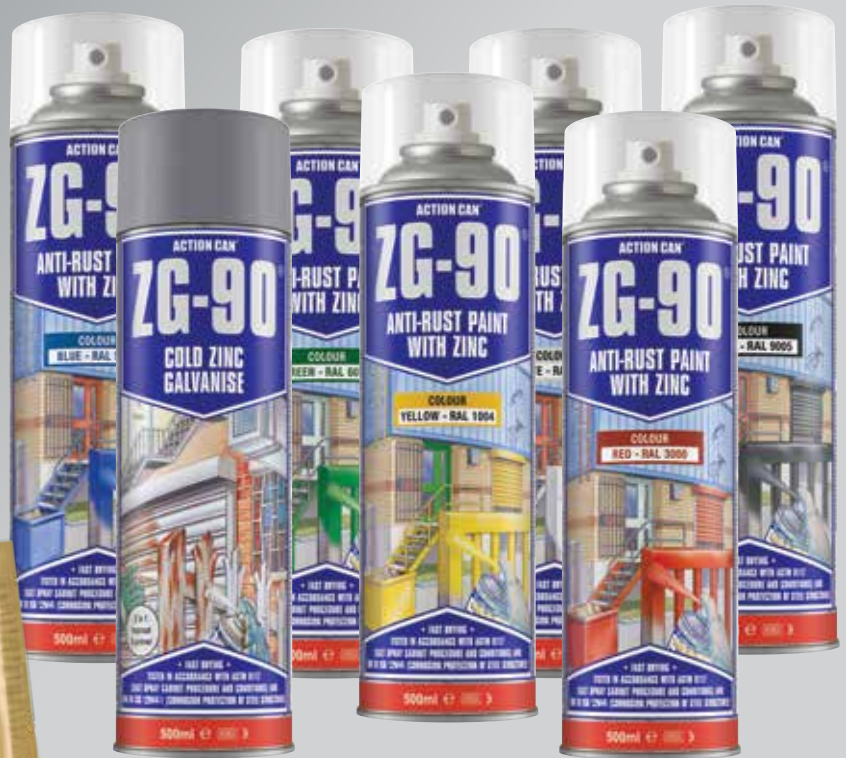
Blue Galvanise Green Yellow White Red Black