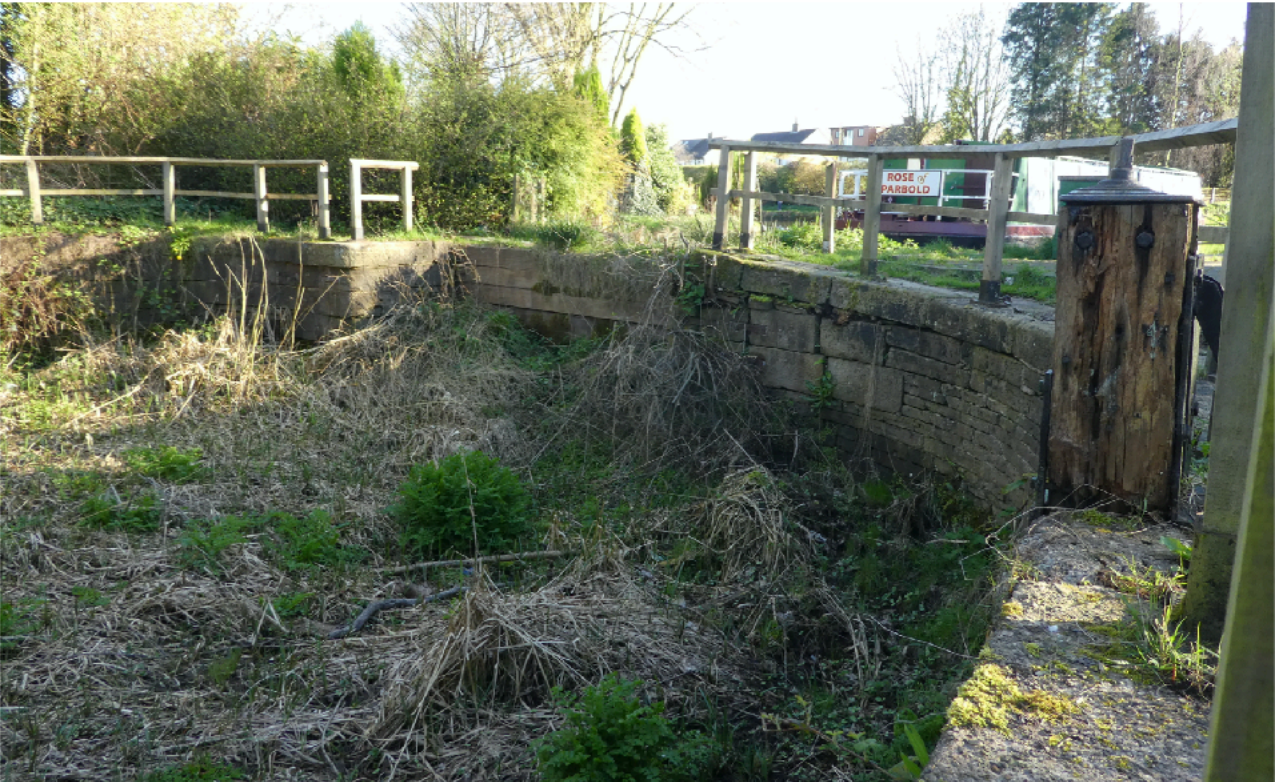
Dock at Parbold looking towards the 'Rose of Parbold' on the right 2017