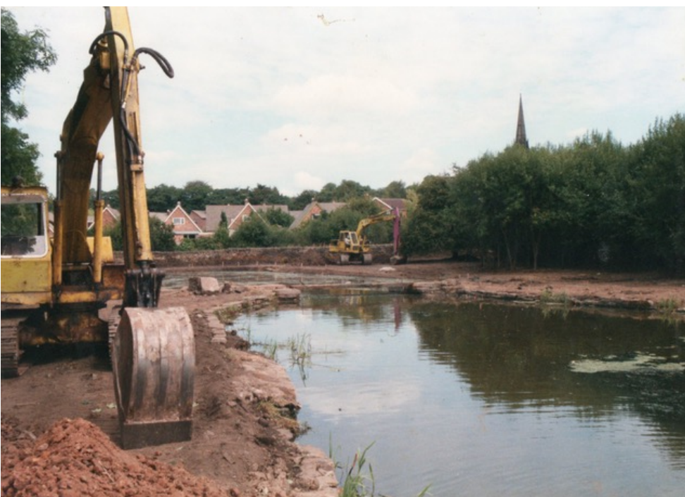
Dock in Water 1990