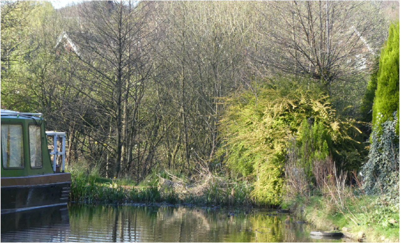
Dock at Parbold 2017 - Barge 'Rose of Parbold' on the left hand side