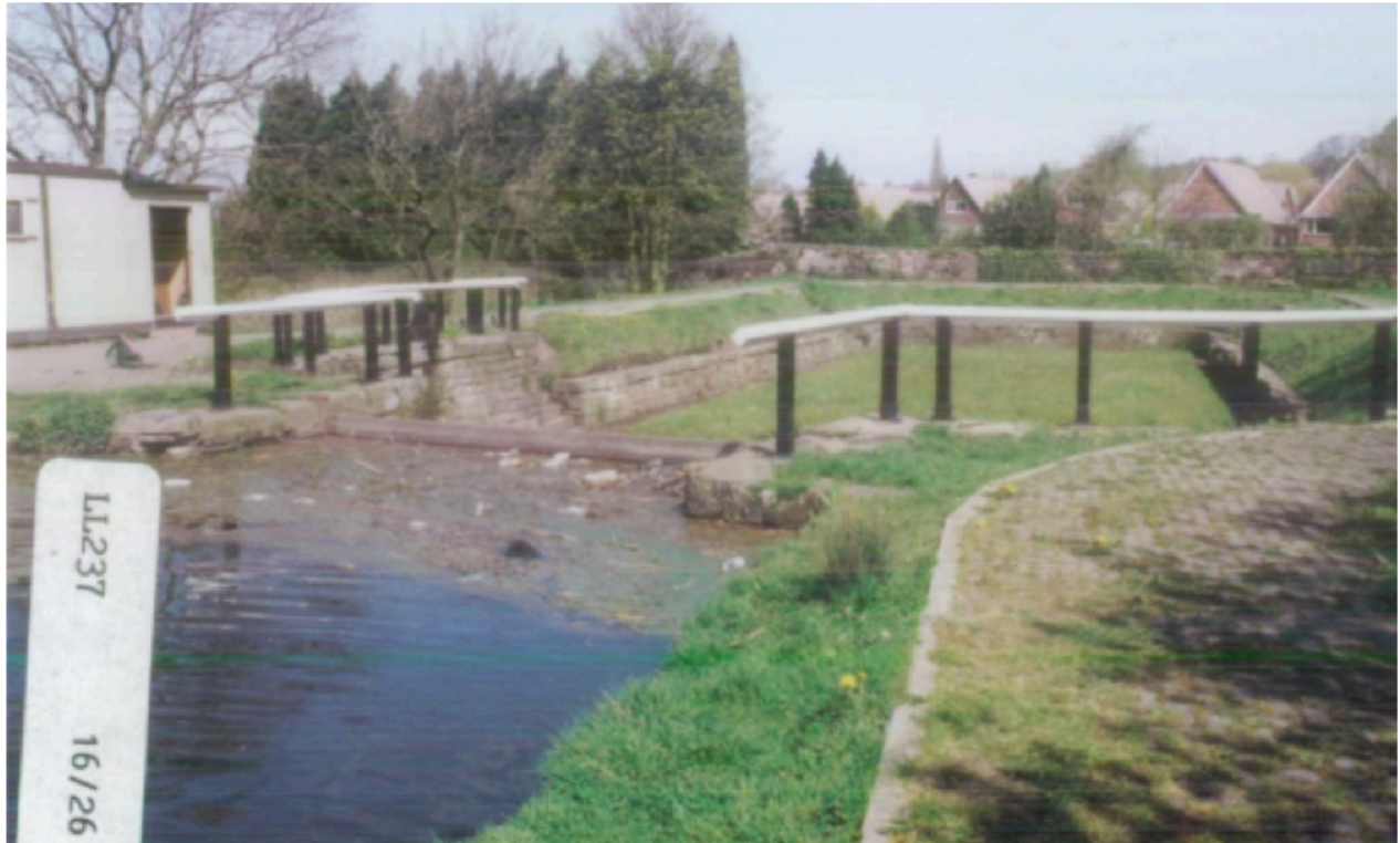
Dock at Parbold - As it looked in 1994