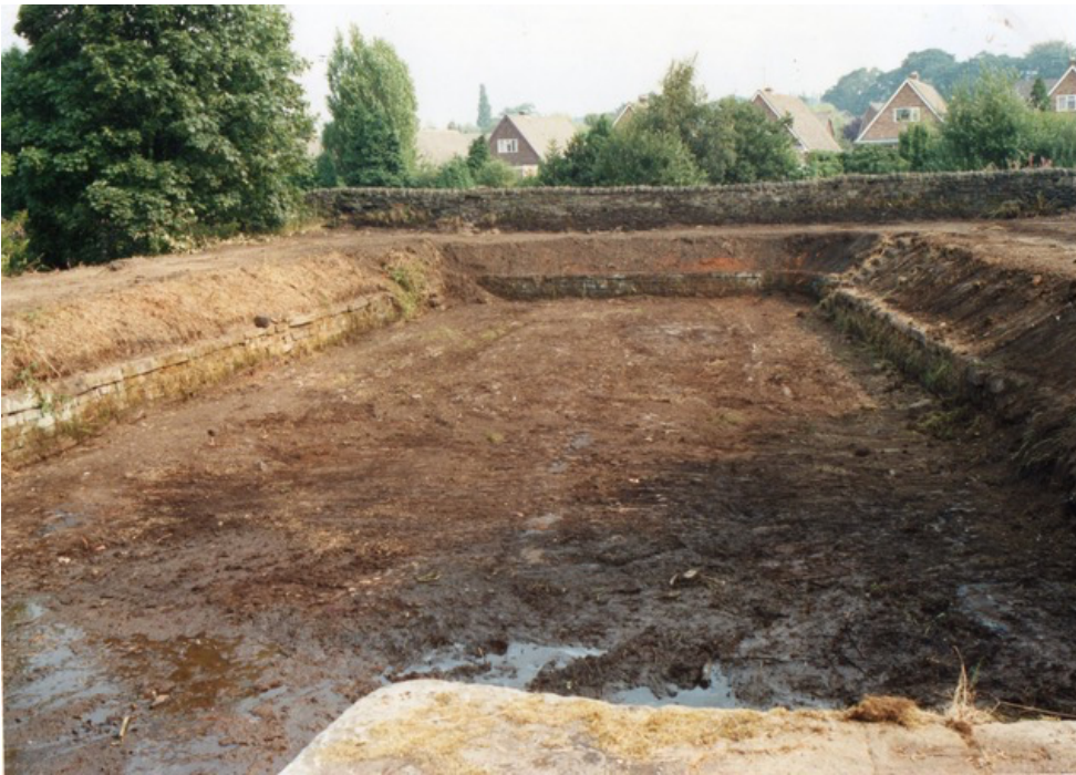
Dock Prior to Flooding 1990

The basin was restored to a working dry dock in 1990 funded by a European Social Grant and Lancashire County Council as part of a training scheme which included the purchase of the 'Rose of Parbold' - after this restoration the Dock was used to fit out the Rose which was delivered to the site as a shell. The dock was owned by British Waterways and for a period maintained by the 'Rose of Parbold' charity until British Waterways following Health and Safety concerns and leakage of water from the canal into the brook retook responsibility for the dock - a clay bund was constructed on the canal side of the stop planks to minimise leakage into the dock. No further maintenance took place over the following 20 years, Nature took its course and the basin became overgrown with trees and other vegetation.