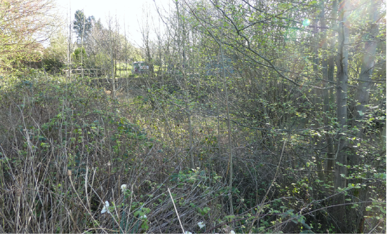
Dock at Parbold looking towards the 'Rose of Parbold' on the left April 2017