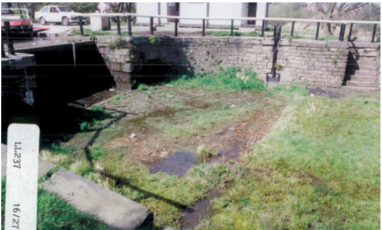
Dock at Parbold looking towards the 'Rose of Parbold' on the left 1994