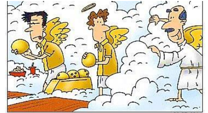
OH, IT'S YOU GUYS ... I THOUGHT I HEARD THUNDER OVER HERE

Three Bowlers stood at the Pearly Gates, Their faces were sad and old, They loudly asked the man at the gate for admission to the fold