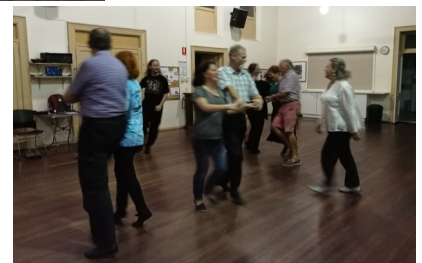
Eightsome Reel (L) and Fisherman's Reel (Below)