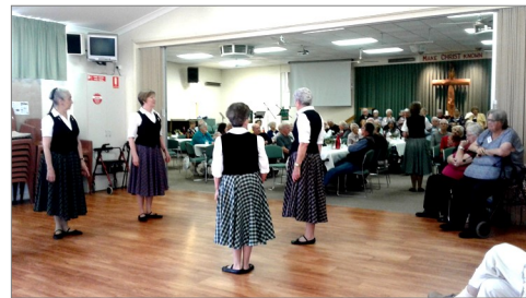
Hebridean Dancers at a Carers Day at Dernancourt Uniting Church (above) and (below) involved in a celebration with members of the Bahá'í Faith at Mellor Park