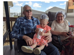
Godly sweet Great-Grandparents

Sending Church: Westwood Heights Baptist Church / 3343 Pedersen Dr Omaha, NE 68144 / 402-333-8689