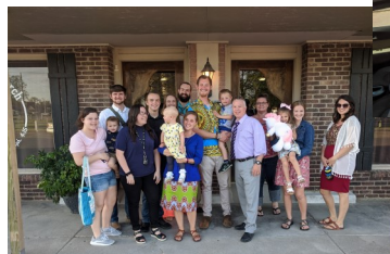
Great friends in KS