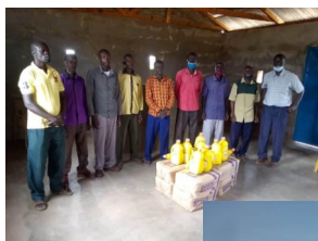
Food bought for pastors by friends in America